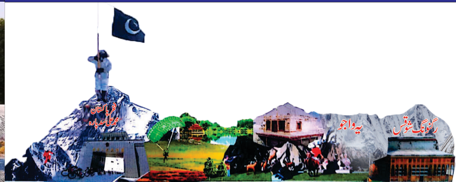
Gilgit-Baltistan Jewel of Pakistan